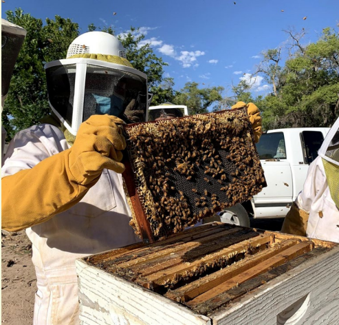
Core members entering and observing hives