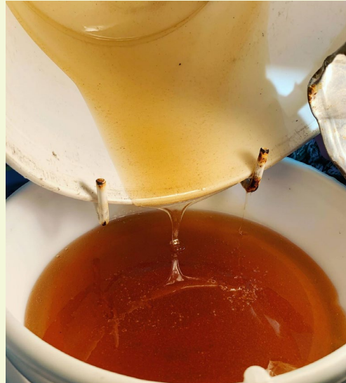
End of the season honey harvest